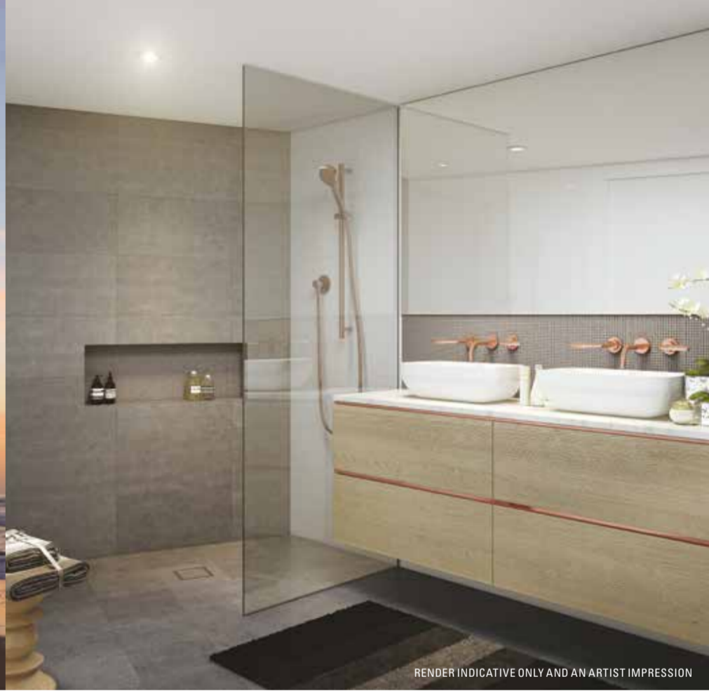
RENDER INDICATIVE ONLY AND AN ARTIST IMPRESSION