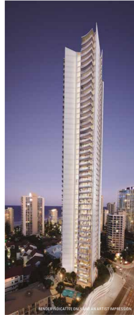
RENDER INDICATIVE ONLY AND AN ARTIST IMPRESSION

Markwell Residences Recreational Retreat is an extraordinarily beautiful haven that ensures escape and revitalisation are part of your everyday. This 1200sqm retreat includes more than 20 regeneration zones to cater for all aspects of relaxation from a dip in the aquatic lounge – a pool that wraps around two sides of the Retreat – to a quiet reflection at the end of the day in one of three secluded thermal baths. An international standard day spa will provide the latest in beauty treatments and relaxation therapies. For a more active start to the day, stretch out on the yoga deck or take advantage of the high tech fitness club. Hide away with your favourite book in a leaf dappled urban garden room or invite family and friends to lunch in the leafy, sunken, plush private dining pavilion. Nothing has been overlooked, everything is in place to create the ultimate combination of inner city and beach living at Markwell Residences.