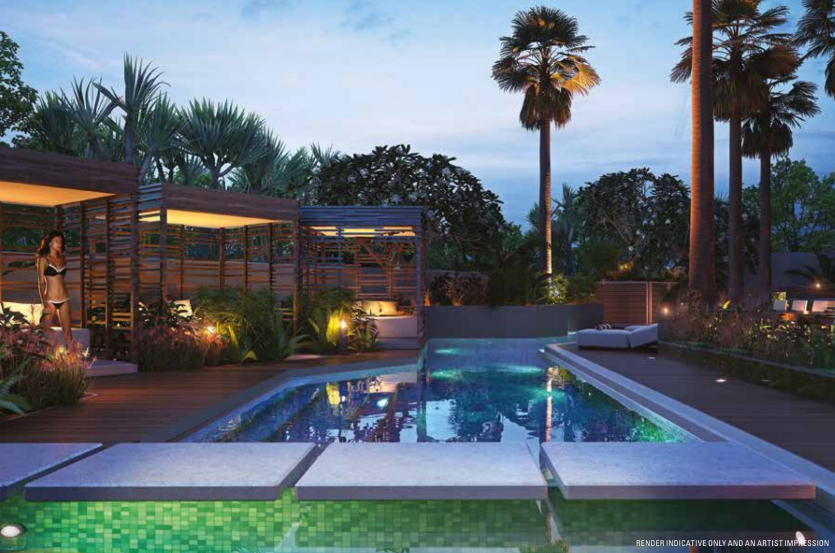
RENDER INDICATIVE ONLY AND AN ARTIST IMPRESSION