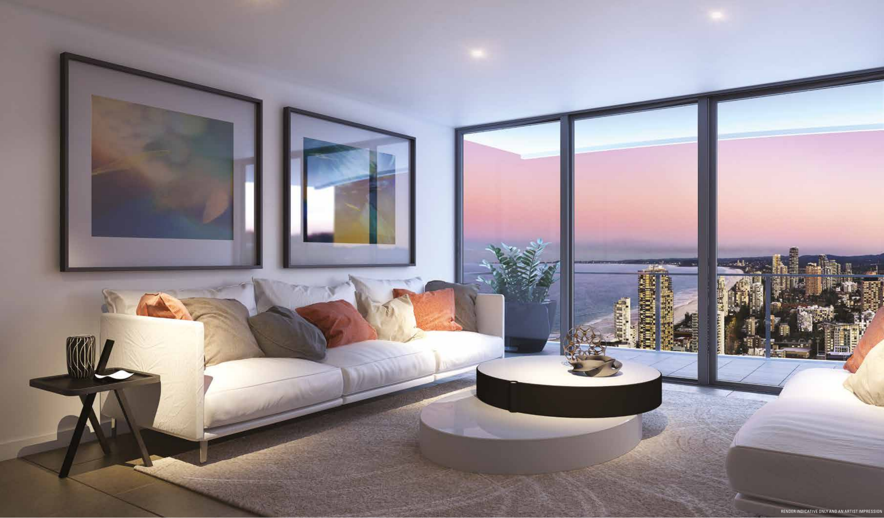
RENDER INDICATIVE ONLY AND AN ARTIST IMPRESSION