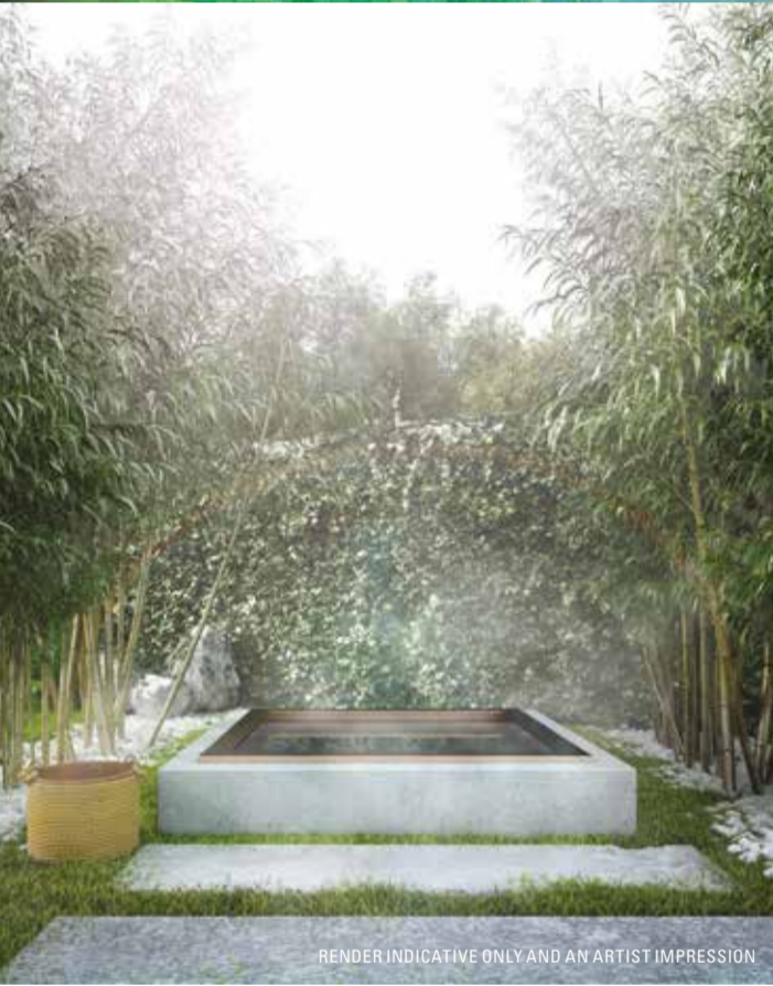
RENDER INDICATIVE ONLY AND AN ARTIST IMPRESSION