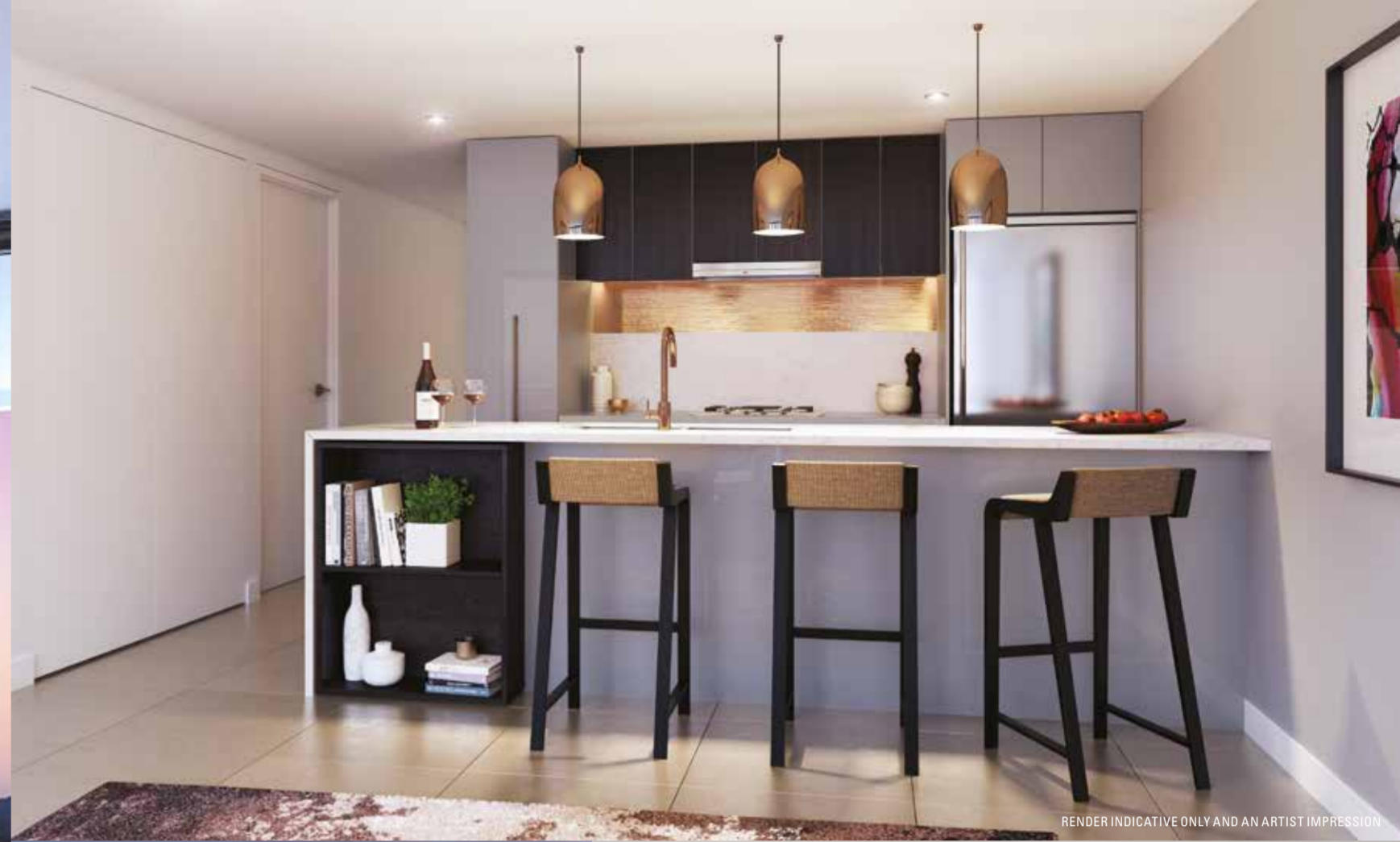
RENDER INDICATIVE ONLY AND AN ARTIST IMPRESSION